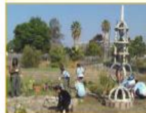
Current masters students and FSPH staff worked with over 100 undergraduate volunteers to clean up a community garden at LA's best kept secret, Watts Towers. Students and staff got to tour the towers and learn about the gardens use to educate the Watts community