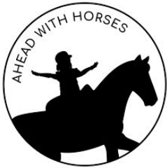
AHEAD With Horses