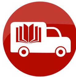
The Book Truck