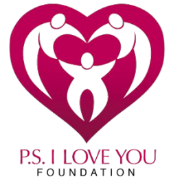
PS I Love You Foundation