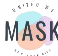
United We Mask