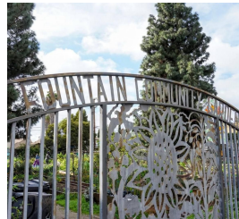
Fountain Community Garden