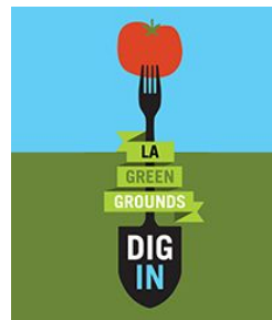
LA Green Grounds