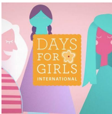
Days For Girls