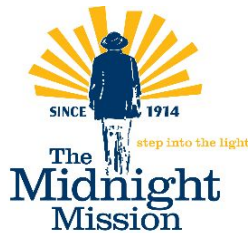
The Midnight Mission