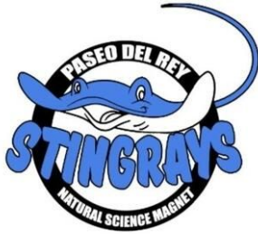
Paseo del Rey Natural Science Magnet