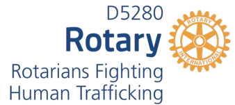
D5280 Rotarians Fighting Human Trafficking