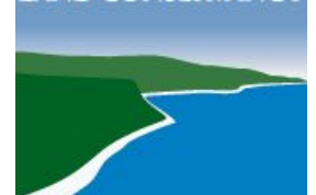
Palos Verdes Peninsula Land Conservancy.