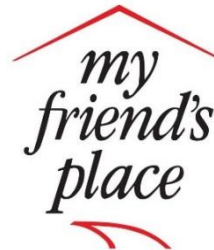
My Friend's Place